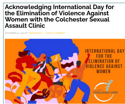
Acknowledging International Day for the Elimination of Violence Against Women with the Colchester Sexual Assault Clinic November, 2022