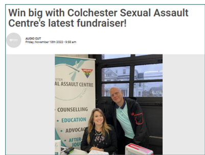
Win big with Colchester Sexual Assault Centre's latest fundraiser! November, 2022