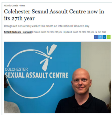
Colchester Sexual Assault Centre now in its 27th year March, 2023