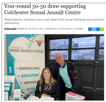
Year-round 50-50 draw supporting Colchester Sexual Assault Centre November, 2022