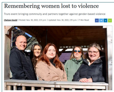
Remembering women lost to violence November, 2022