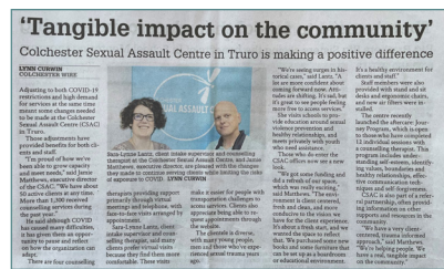
'Tangible impact on the community' August, 2022